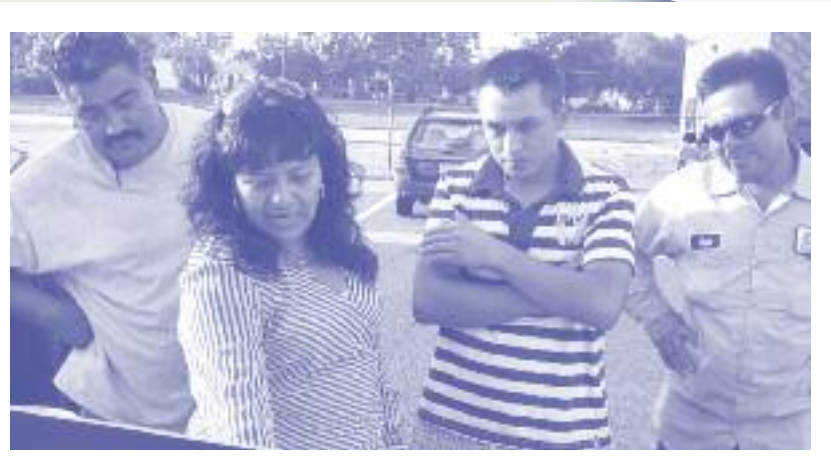
Commerce City residents talk about their journey to their neighborhood.