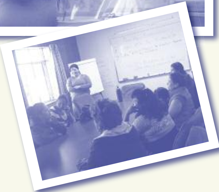
Bottom: Commerce City Community Enterprise staff interpreting during a bilingual NeighborCircle at their office.