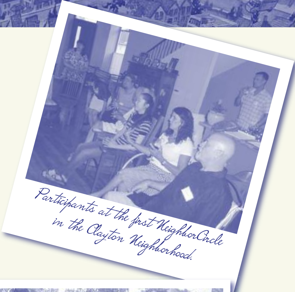
Participants at the first NeighborCircle in the Clayton Neighborhood.