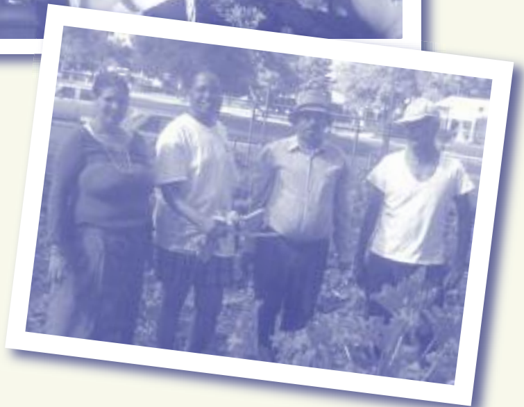
Top: Feed Denver youth placing soil on asphalt on 42nd & Steele. Bottom: Bhutanese and other neighborhood farmers volunteering at 42nd & Steele.