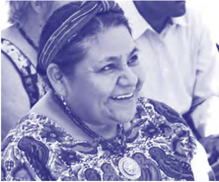
Nobel Peace Prize winner Rigoberta Menchú Tum blessing the Holly Redevelopment space