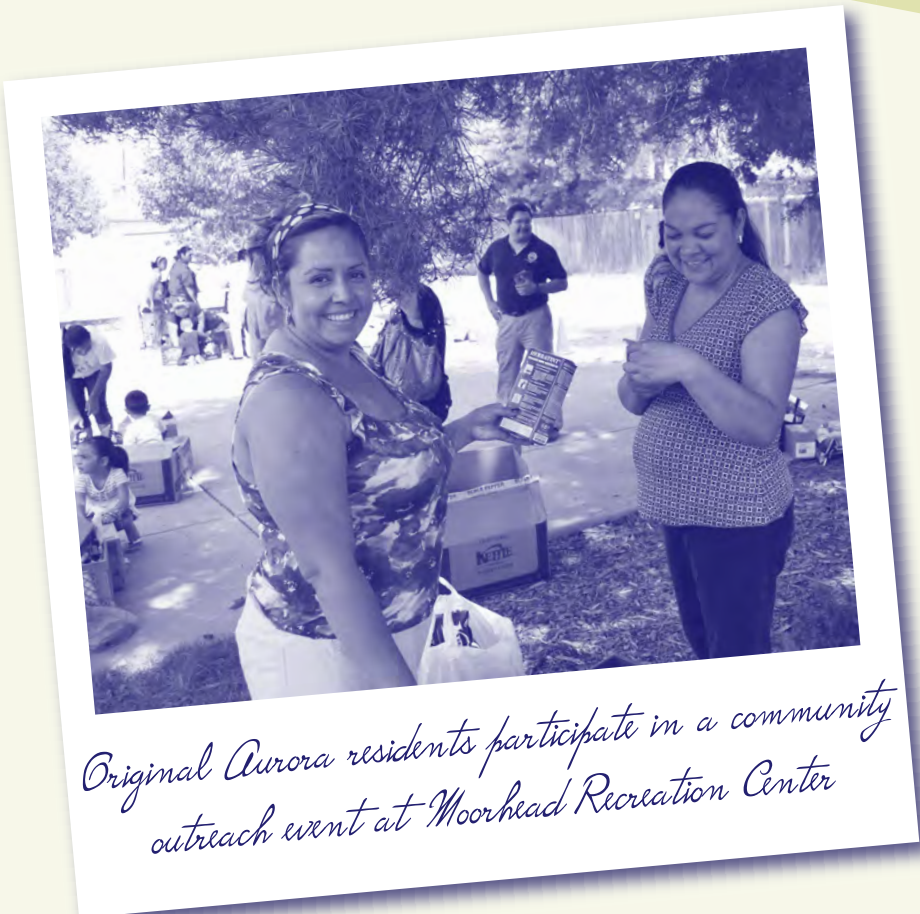
Original Aurora residents participate in a community outreach event at Moorhead Recreation Center