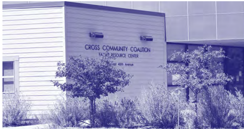
Cross Community Coalition's New Home